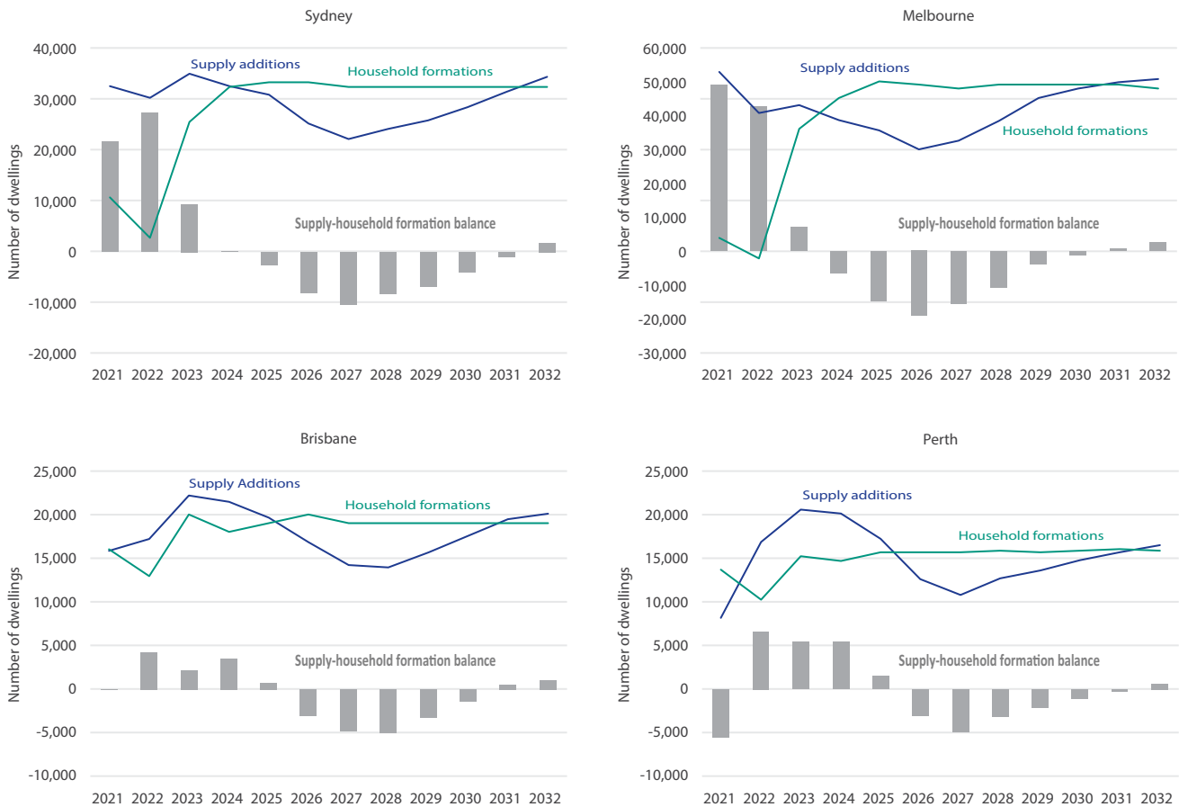
Figure 4.3: Annual change in household formation and supply and supply-household formation balances by city – Sydney, Melbourne, Brisbane and Perth

In Brisbane and Perth, the peak shortfall is around 5,000 dwellings. The supply shortfall is then reduced as supply increases from around 2027 and marginally exceeds household formation by the end of the projection period.