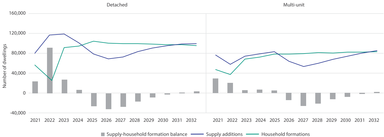
Figure 4.2: Supply-household formation balance by dwelling type 10

Household formation also bottoms out in 2022 for multi-unit dwellings, but supply also declines from the previous year, resulting in supply exceeding household formation by 21,200 dwellings. Household formation rises the following year but does not reach pre-pandemic levels until 2025. Supply also rises in 2023 and modestly exceeds household formation until 2026 before dropping below household formation levels, leading to a supply shortfall of 26,300 dwellings in 2027. Supply then recovers and but remains below household formation each year out to 2031.